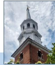
Holy Trinity's 300 th Anniversary