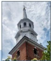
Holy Trinity's 300 th Anniversary

As we bask in the glow of the Advent Candles, please take the time to reflect on the Season. And, recognize that with each end there is a new beginning...now and always.