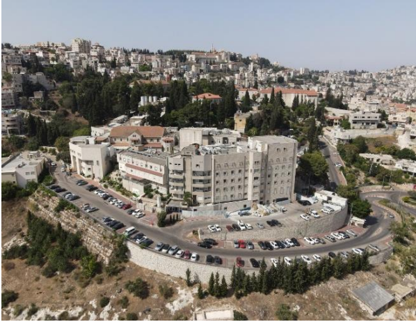
NAZARETH HOSPITAL AND SCHOOL OF NURSING

Each year, Holy Trinity's International Ministries Committee (IMC) selects a project for the Valentine Appeal, inviting our congregation to extend Christ's love to those in need of physical and spiritual healing and to make a positive impact on the communities in which they live. For 2026, we are partnering with the Nazareth Hospital in Israel to support the "Advanced Medical Training of West Bank Doctors" program.